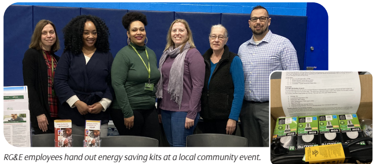
RG&E employees hand out energy saving kits at a local community event.

Our customer service advocates and representatives met with customers and handed out free energy saving kits. The kits contain four LED light bulbs, a faucet aerator, showerhead and power strip.