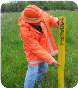
Line markers, such as the one above, indicate a buried natural gas pipeline's general location.

We work with industry groups to continually enhance natural gas pipeline safety. We also work with emergency responders, and state and local agencies, to prevent and prepare for emergencies through training and periodic drills.