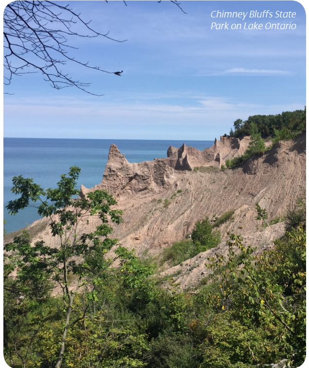
Chimney Bluffs State Park on Lake Ontario

For more information about our FREE payment options, please visit rge.com .