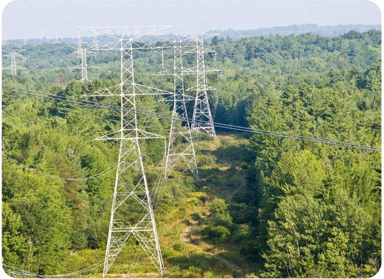
Our "eye in the sky" covers some of the most remote areas in our service territory, giving us the necessary information to make repairs quickly and efficiently.

Drones have become one of the many innovative tools we use to quickly and efficiently perform inspections of substations and transformers. Drones allow us to safely scan and evaluate large areas of our system while it is still energized. We can identify issues and resources needed for maintenance or repair, and perform the work safely in a shorter period of time.