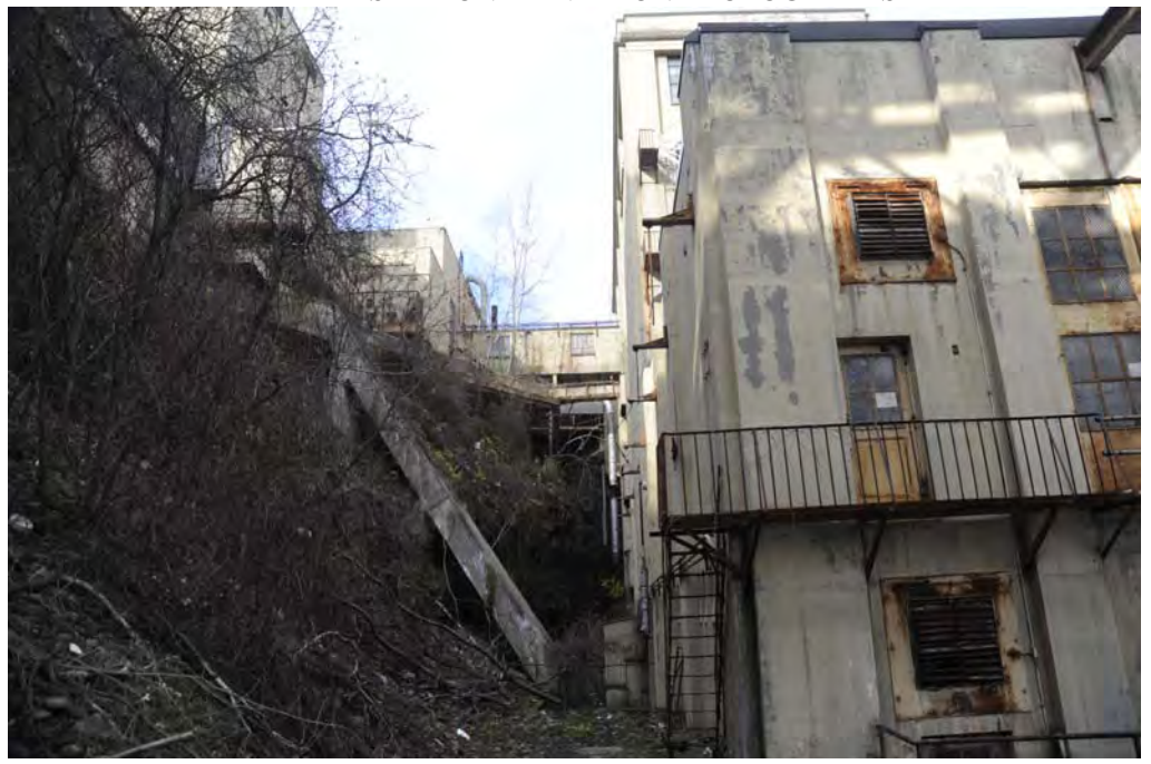
#11 - Beebee Station Looking North (Genesee Gorge to Left, Switch House to Right)