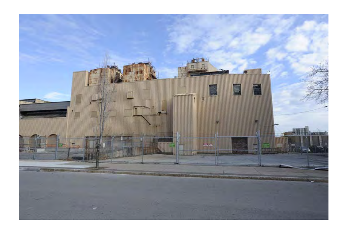
#13 – Beebee Station Looking East (3 / 4 Boiler House and 1 / 2 Boiler House West Elevations)