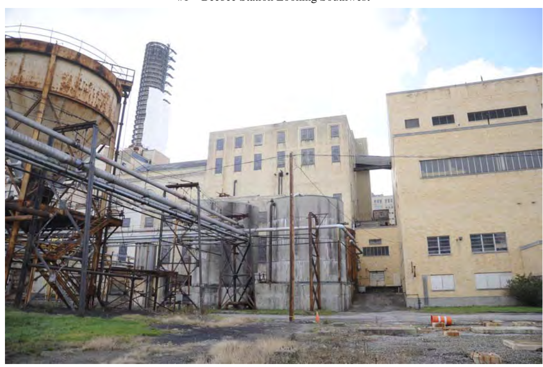
#2 – Beebee Station Looking West (from right to left: Unit 12 Building , 7/8 Boiler Room and 10/11 Turbine Building)