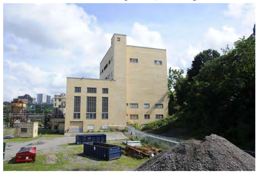
#6 – Beebee Station Looking South (Unit 12 Building)