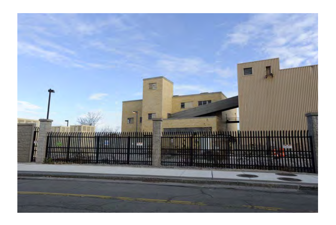
#15 – Beebee Station Looking East (Unit 12 Building West Elevation)