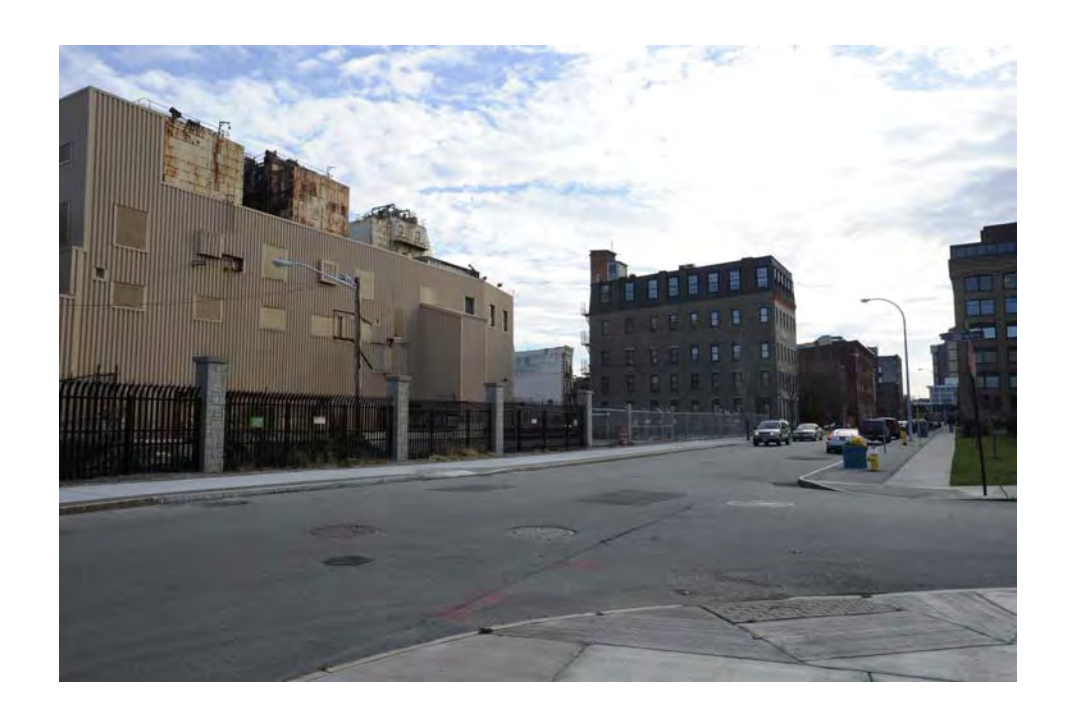
#17 – Beebee Station Looking Southeast from Mill Street