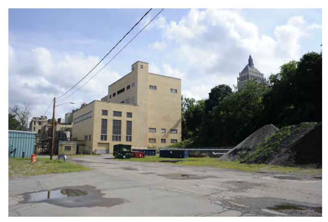
#5 – Beebee Station Looking Southwest (Unit 12 Building)