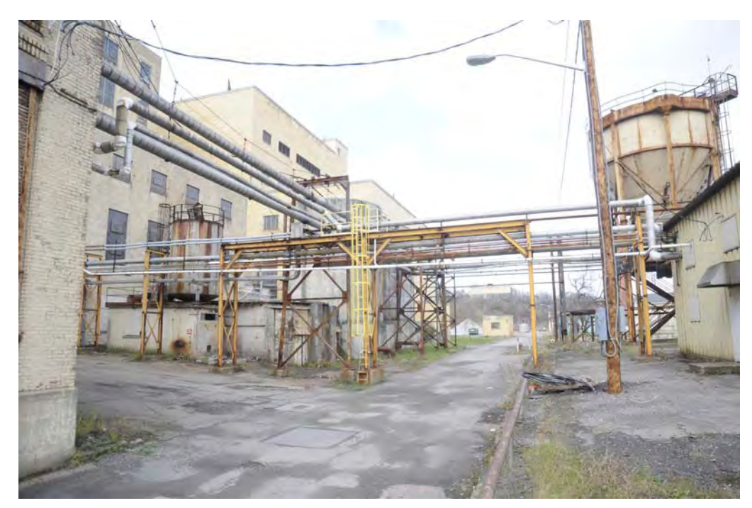
#9 – Beebee Station Looking Northwest (Turbine Hall)