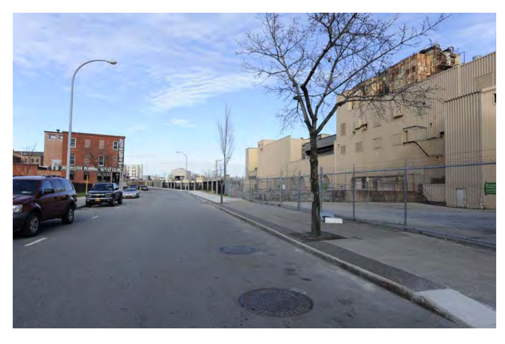
#16 – Beebee Station Looking Northeast from Mill Street