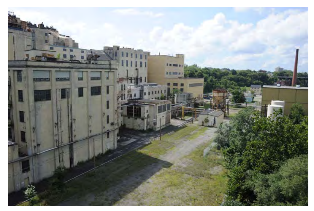
#7 – Beebee Station Looking Northwest (Switch House on the Left Side of Photograph)