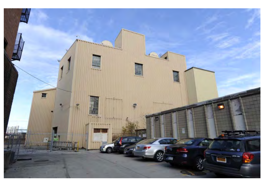
#12 - Beebee Station Looking North from Volt Place ( 1 / 2 Boiler House and Station 3 Office South Elevation)