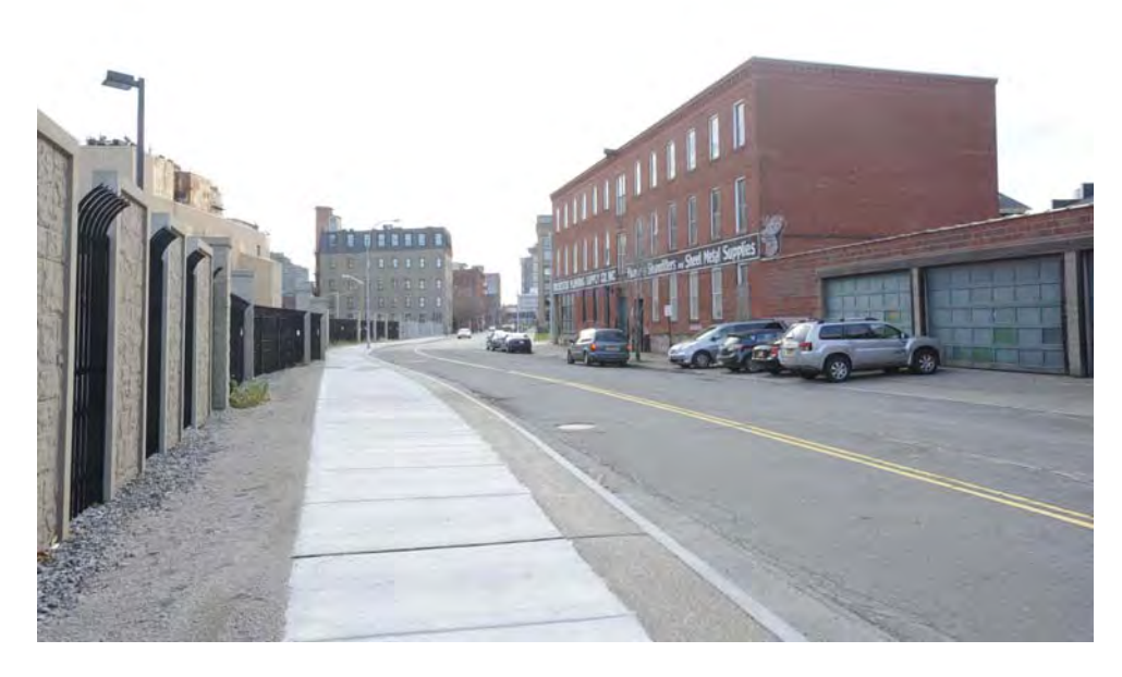
#18 – Beebee Station Looking Southwest from Mill Street