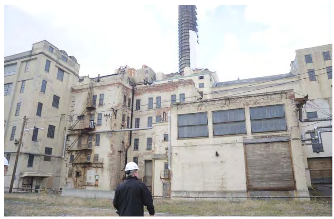
#3 – Beebee Station looking West (Old Turbine Hall and Package Boiler Room in Center of Picture)