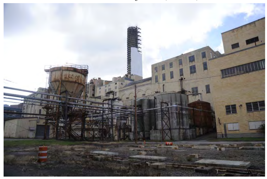
#10 – Beebee Station Looking Southwest (10/11 Turbine Hall)