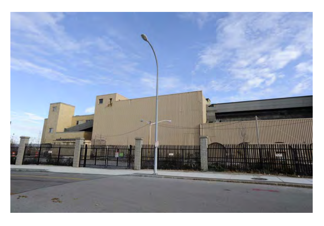
#14 – Beebee Station Looking Northeast from Mill Street (Unit 12 Building, 7 / 8 Boiler House and Bigelow House West Elevation)