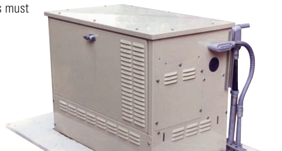
Typical stationary natural-gas fired generator