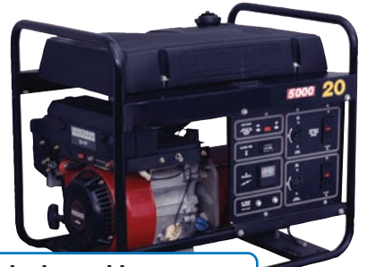
Typical portable generator