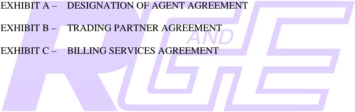
EXHIBIT C – BILLING SERVICES AGREEMENT